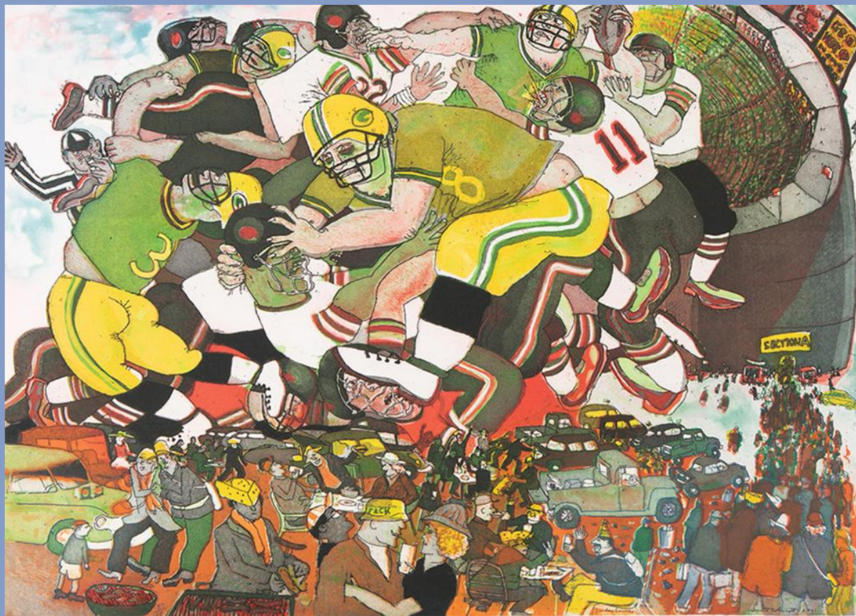
Sunday Service, 2001