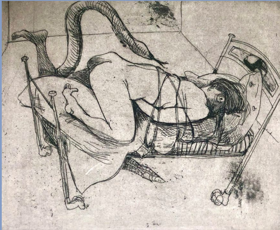
Nightmare 3 , Etching, 20cm x 25cm