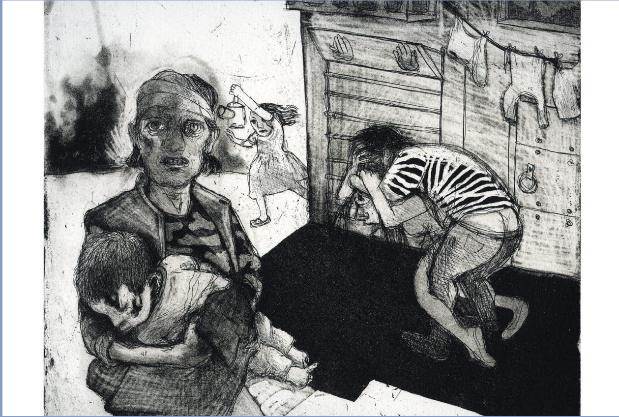
Howl of protest: 'The Crying Game 4: Remnants of Civilization 1', 2015, by Marcelle Hanselaar