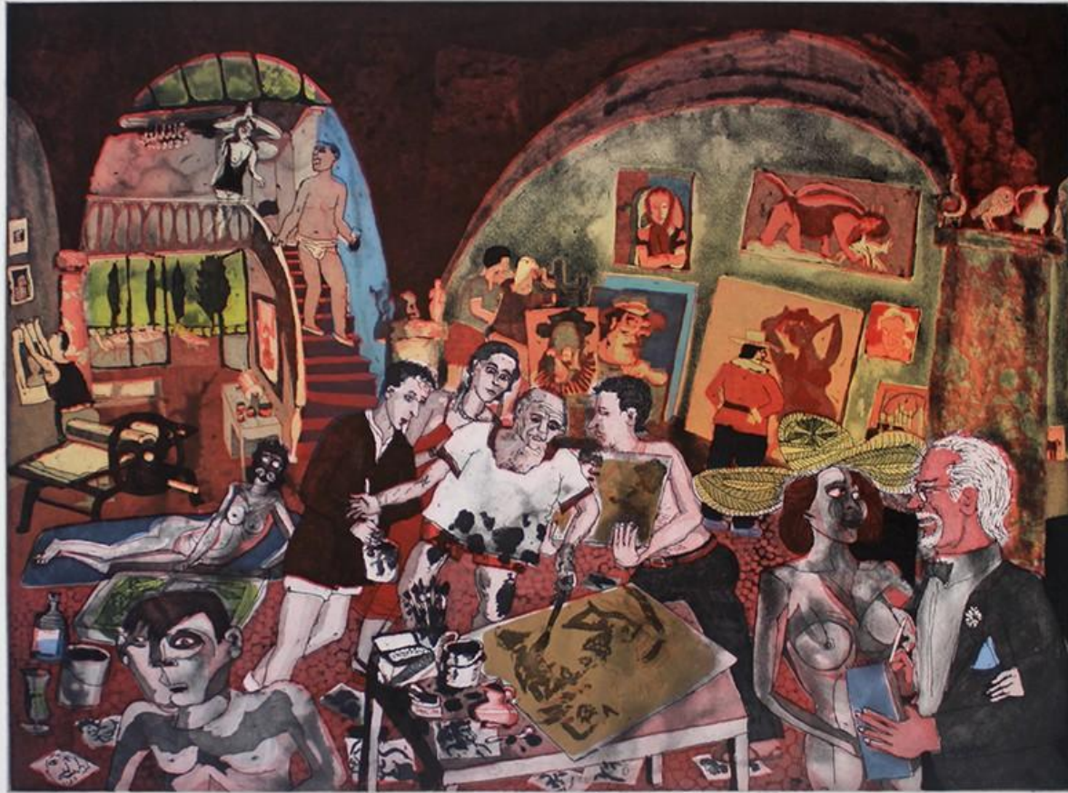
Picasso at Mougins: The Etchings 2002