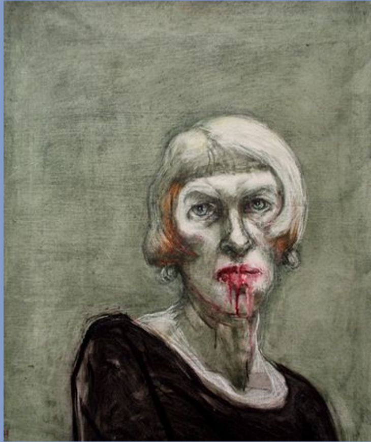
Self portrait of yesterday, 2012, oil on canvas, 60 x 50 cm