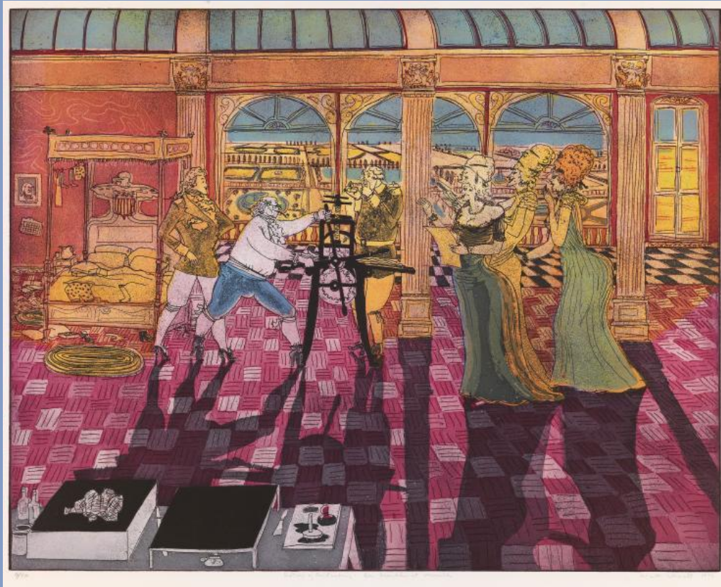
Ben Franklin at Versailles , from the series A History of Printmaking , 1976, color intaglio on paper, 23 7 / 8 x 35 7 / 8 in.