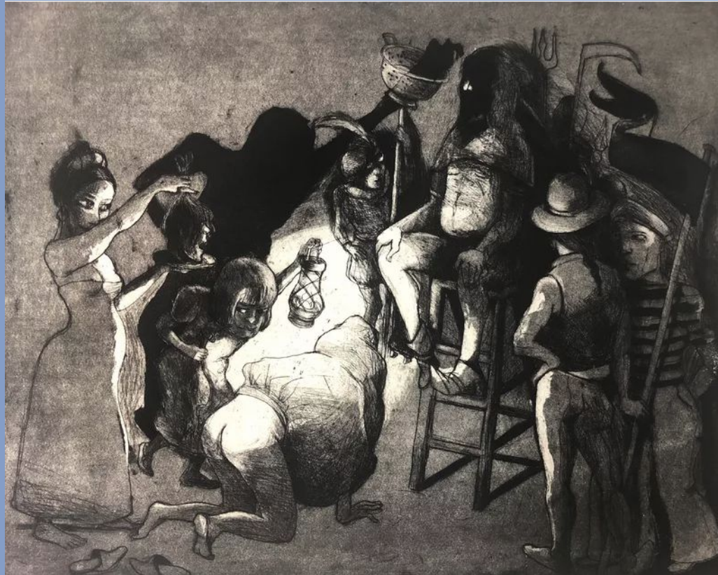
After the Night Watch , 2021, Etching & Aquatint, 22 × 29 9/10 in | 56 × 76 cm